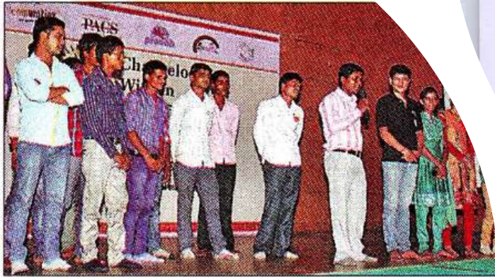
■ Young leaders of project Changelooms share their experiences at an event held at Gandhi Bhavan in Bhopal on Saturday.

100 such potential youth leaders. Supported by Poor Areas Civil Society (PACS), it is coordinated in Madhya Pradesh by Harda-based NGO Synergy Sansthan.