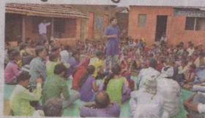
हरदा। युवाओं ने निवृत्तों के सामाजिक समावेश यात्रा।